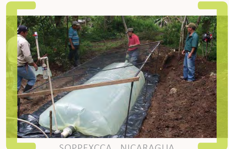
SOPPEXCCA . NICARAGUA

The organization hopes to expand the number of families benefitting from improvements in infrastructure for water harvesting (currently, 51 works are in progress), which is the biggest need identified by families.